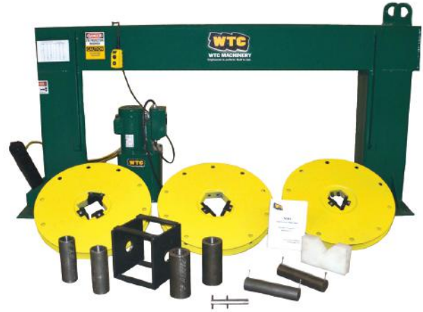
B2888-001 SCRS Small Cylinder Bench and B3572 Square Nut Socket (Optional)

Using the self-contained hydraulic system, the SCRS loosens and tightens piston nuts up to 20,000 lb-ft (27,100 N-m).