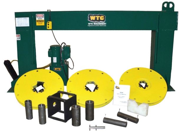
B2888-001 SCRS Small Cylinder Bench and B3572 Square Nut Socket (Optional)

Using the self-contained hydraulic system, the SCRS loosens and tightens piston nuts up to 20,000 lb-ft (27,100 N-m).